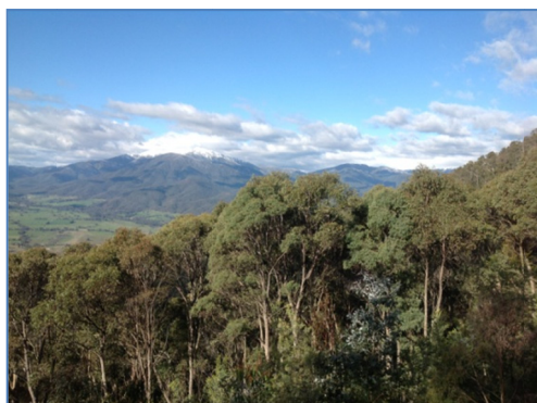
A taste of what you will see.

Due to the smaller communities that we will be staying in this ride will be